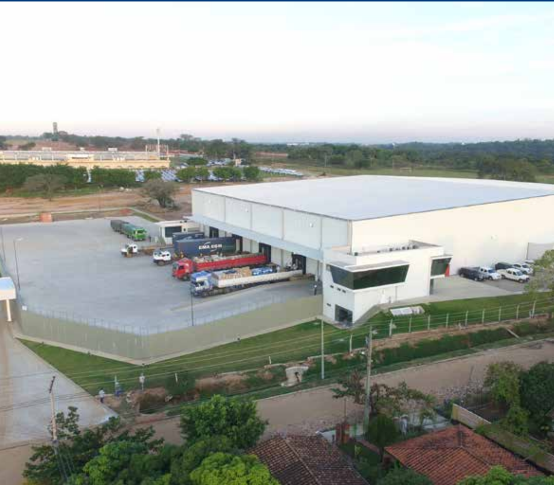
Caacupe-mí Logistic Park Division / Asunción