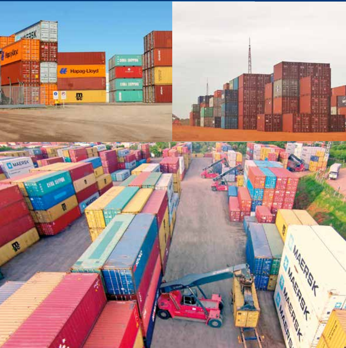
Caacupe-mí Port / Asunción